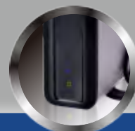
Power and HDD LED indicators