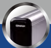
Aluminum stylish casing with excellent heat dissipation to ensure hard disk stability