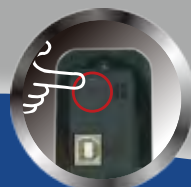
Instant file backup with a push of OTB (one-touch-backup) button